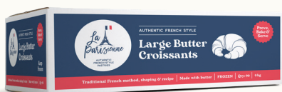
Unbaked Large Butter Croissants (Qty 90)