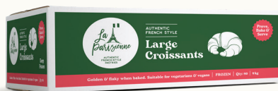
Unbaked Large Croissants (Qty 90)