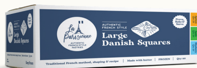
Unbaked Large Danish Squares Mixed (Qty 60)

20 x Apricot, 20 x Apple, 20 x Blueberry