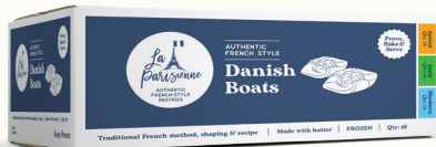
Unbaked Danish Boats Mixed (Qty 48)

16 x Apricot, 16 x Apple, 16 x Blueberry