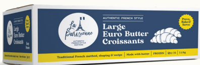
Unbaked Large Euro Butter Croissants (Qty 72)

16 x Apricot, 16 x Apple, 16 x Blueberry